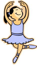
Pre-Ballet & Tap-Ballet